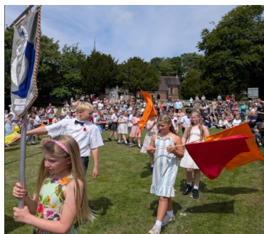
The maypole procession

What a wonderful day we had for our school Mayfair! The weather was kind in the end with the sun shining and the amazing maypole dancing came together brilliantly. The children looked fantastic as always in their flowers and smart clothes. A special highlight was the parade for our Year 6 King and Queen, followed by the eagerly awaited ribbon throwing – a proud moment for our Year 6 children. Thank you to all the families for your fantastic support, especially the PTA who organised the fair, (now called Whitegate Fest), our fair volunteers (including some pupils!) and those who joined us on the field to enjoy the activities, games and food. Finally, a big thank you to the children who took part in 'Soak the Teacher' – you certainly seemed to enjoy it... maybe a little too much!